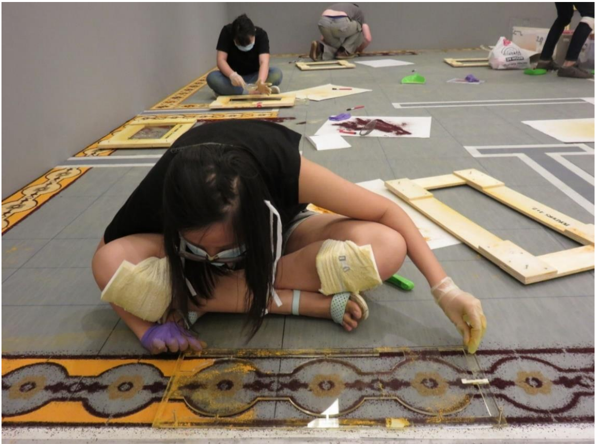
Figure 5. Laurent Mareschal / Adagp, Beiti (installation process), 2021. Sumac, za'atar, ginger, turmeric, white pepper on linoleum, 6.80 x 5.80 m. Haifa: Beit Ha'Gefen Art Centre.