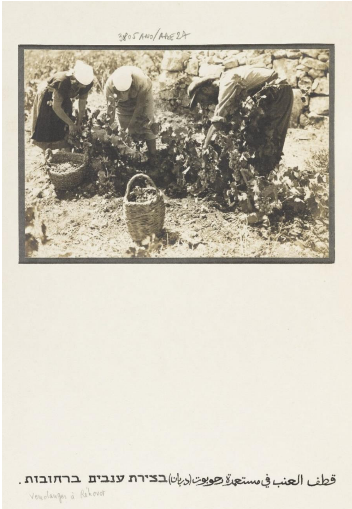
Figure 6. Harvest in Rehovot , year and maker unknown. Photograph in album, 16 x 11 cm. Lenkin Family Photography of the Holy Lands Collection at the University of Pennsylvania Libraries, Library at the Herbert D. Katz Center for Advanced Judaic Studies, University of Pennsylvania.