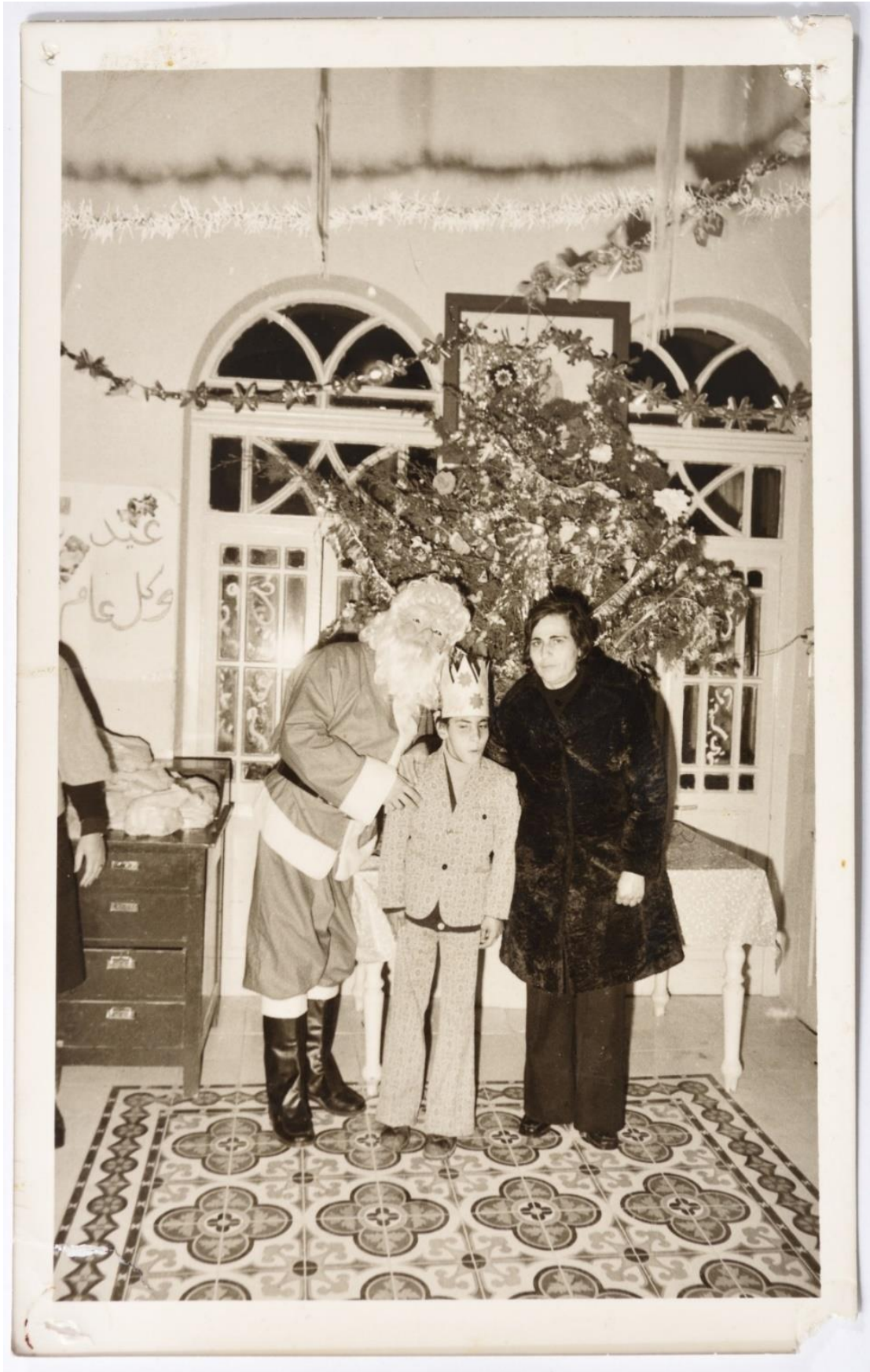
Figure 3. A Glimpse of Christmas at al-Nabda Women Association in Ramallah, 1977. Photograph, 14 x 9 cm. Ramallah.