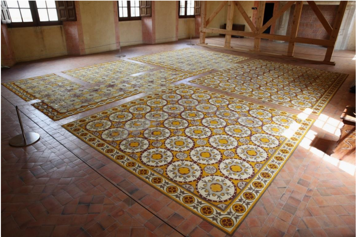
Figure 1. Laurent Mareschal / Adagp, Beiti , 2021. Sumac, za'atar, ginger, turmeric, white pepper on linoleum, 6.80 x 5.80 m. Château de Fougères-sur-Bièvre.