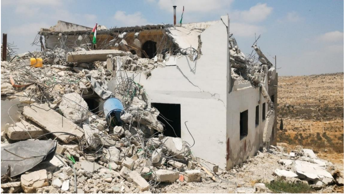
Figure 4. Ruins of Saleh family home, Deir Abu Mash'al, 2017. Ramallah district.